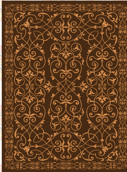
5'3" X 7'7" Area Rug