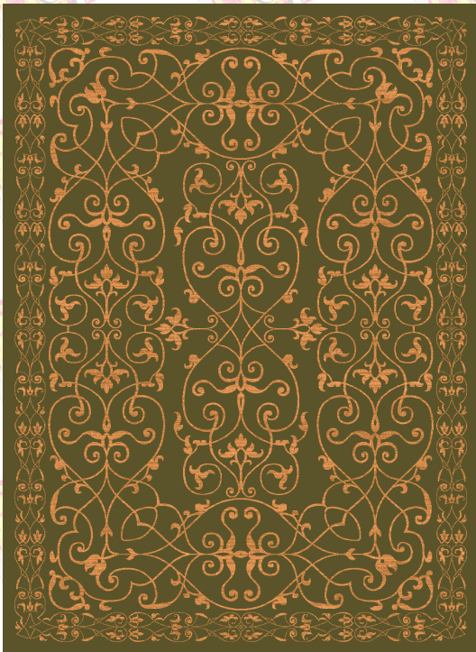
7'10" X 10'10" Area Rug