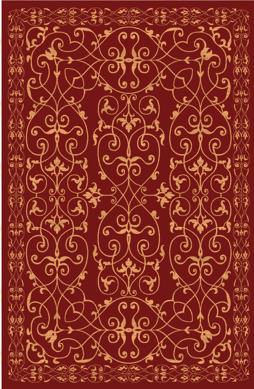
MATRIX - CHERRY